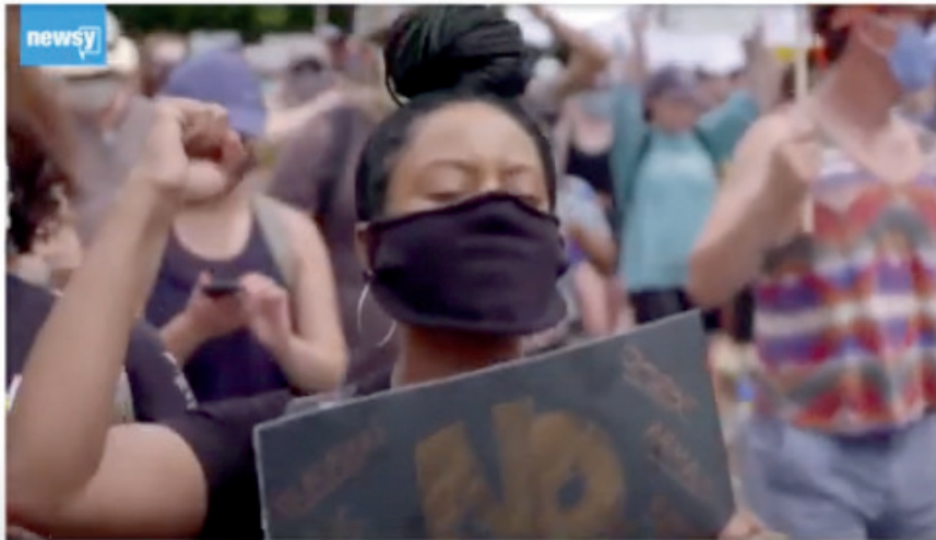
Understanding Racial Trauma

AVAILABLE NOW IN ACHIEVE , this extraordinary collection features over 100 new clips from high-quality sources—classic and contemporary—as well as engaging original content. It's a remarkably diverse and relevant resource, developed in partnership with a faculty and student advisory board.